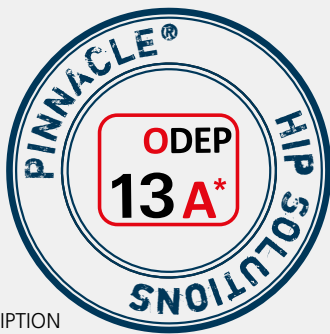
5A* PINNACLE GRIPTION Acetabular System

In 2019 the PINNACLE Cementless Acetabular Cup was awarded an ODEP 13A* by the Orthopaedic Data Evaluation Panel. 3