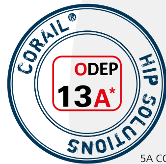
5A CORAIL Cemented Total Hip System

In 2018 the CORAIL and CORAIL AMT Total Hip System were awarded an ODEP 13A* by the Orthopaedic Data Evaluation Panel. 3